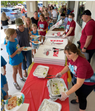
Swenson Children's Foundation was delighted to host a pizza lunch for the group on the last day of the VBS.

Faith Community Church in Carlsbad, CA welcomed approximately 150 children from the church and surrounding community to its Vacation Bible School the week of July 25th. And what a great week it was! the children had a ball playing games, participating in arts and crafts projects and hearing inspiring stories from the Bible. It was an opportunity for them to share the VBS experience with their friends and to make new friends as well.