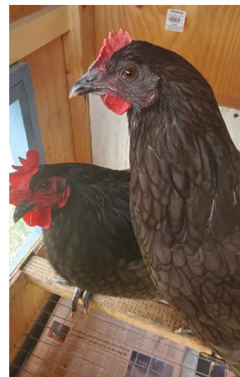
Chicks are all grown now and proudly laying eggs